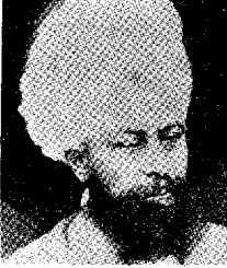
KHALIFATUL MASIH II

Lecture delivered by Hazrat Khalifatul-Masih II, the Second Successor of the Promised Messiah, peace be on him.