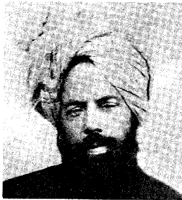
HAZRAT MIRZA GHULAM AHMAD (THE PROMISED MESSIAH)