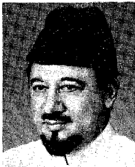
MIRZA MUBARAK AHMAD

(Lecture delivered in Indonesia in 1969) (Second of Series)